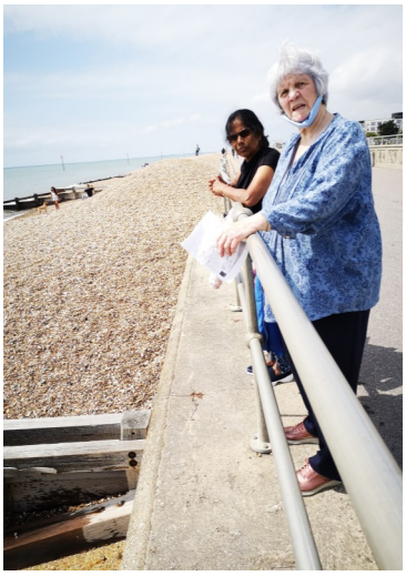
TO THE SEA... TO THE SEA... LET'S GO TO THE SEASIDE...