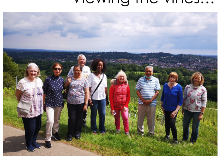
Viewing the vines...