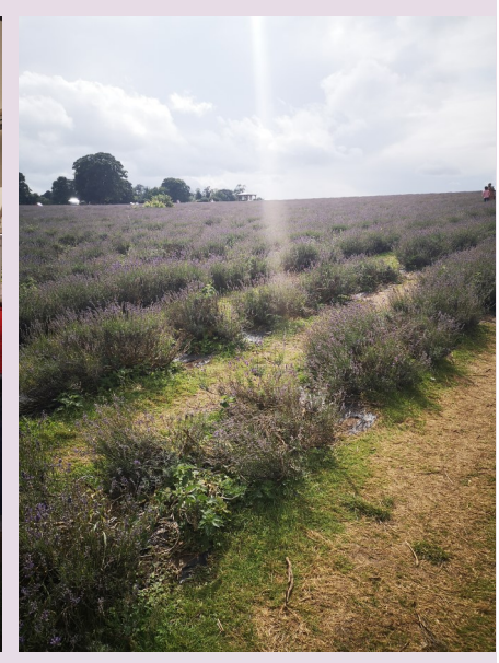
Cream tea among the Lavender at Mayfield Lavender Farm